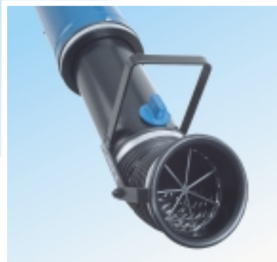
Suction nozzle with damper and 360° swivel

Fumex also offers a range of fans, accessories, automatic control devices and filters for our local extractors.